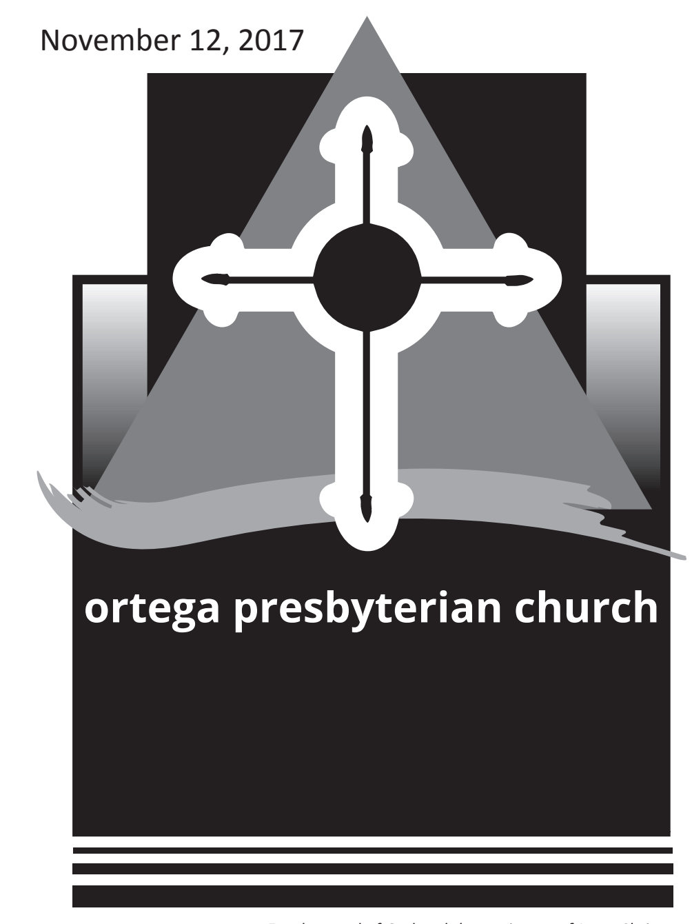
For the word of God and the testimony of Jesus Christ... Revelation 1:9

Listen to White Horse Inn sponsored by Ortega Presbyterian Church on WAY Radio AM 550 and 103.3 FM Saturdays at 2:30 & 10:30 PM. For a Modern Reformation: www.whitehorseinn.org